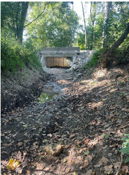
From Meramec looking West towards crossing