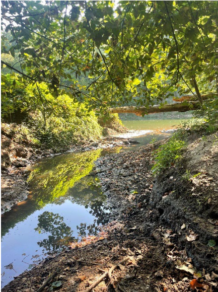
Tributary meeting Meramec River

SUBJECT: Pre-2015 Regulatory Regime Approved Jurisdictional Determination in Light of Sackett v. EPA , 143 S. Ct. 1322 (2023), MVS-2024-401