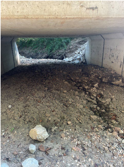
View of box culvert, facing East