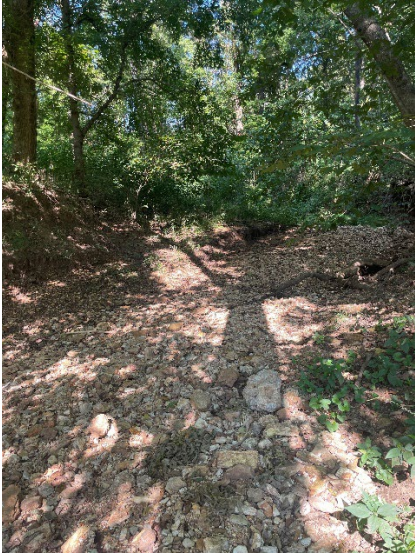
View of tributary facing West, West side of crossing

SUBJECT: Pre-2015 Regulatory Regime Approved Jurisdictional Determination in Light of Sackett v. EPA , 143 S. Ct. 1322 (2023), MVS-2024-401