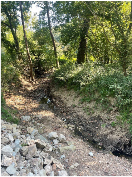
From crossing, looking East, towards Meramec River

SUBJECT: Pre-2015 Regulatory Regime Approved Jurisdictional Determination in Light of Sackett v. EPA , 143 S. Ct. 1322 (2023), MVS-2024-401