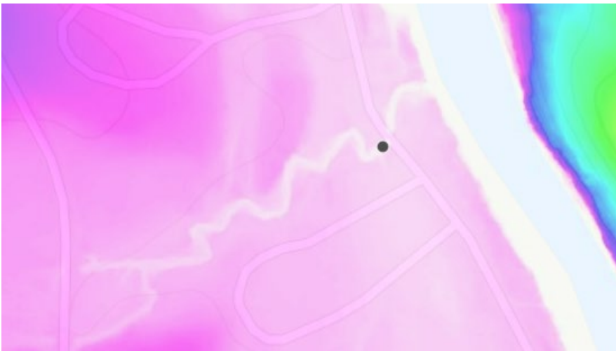
Digital Elevation Model